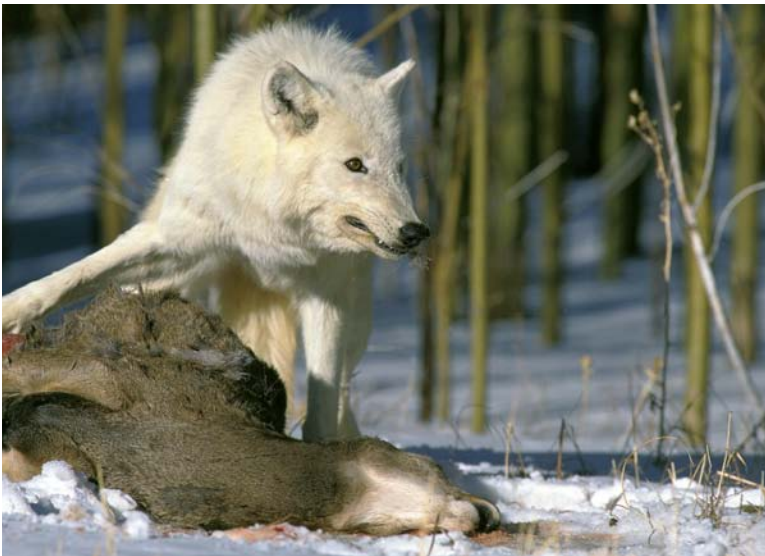
This white wolf is using body position to communicate while standing over its prey.

Pack members use the position of their ears, mouths, and tails to communicate. They also use barks, whimpers, and howls. Wolves smell and lick each other, too.