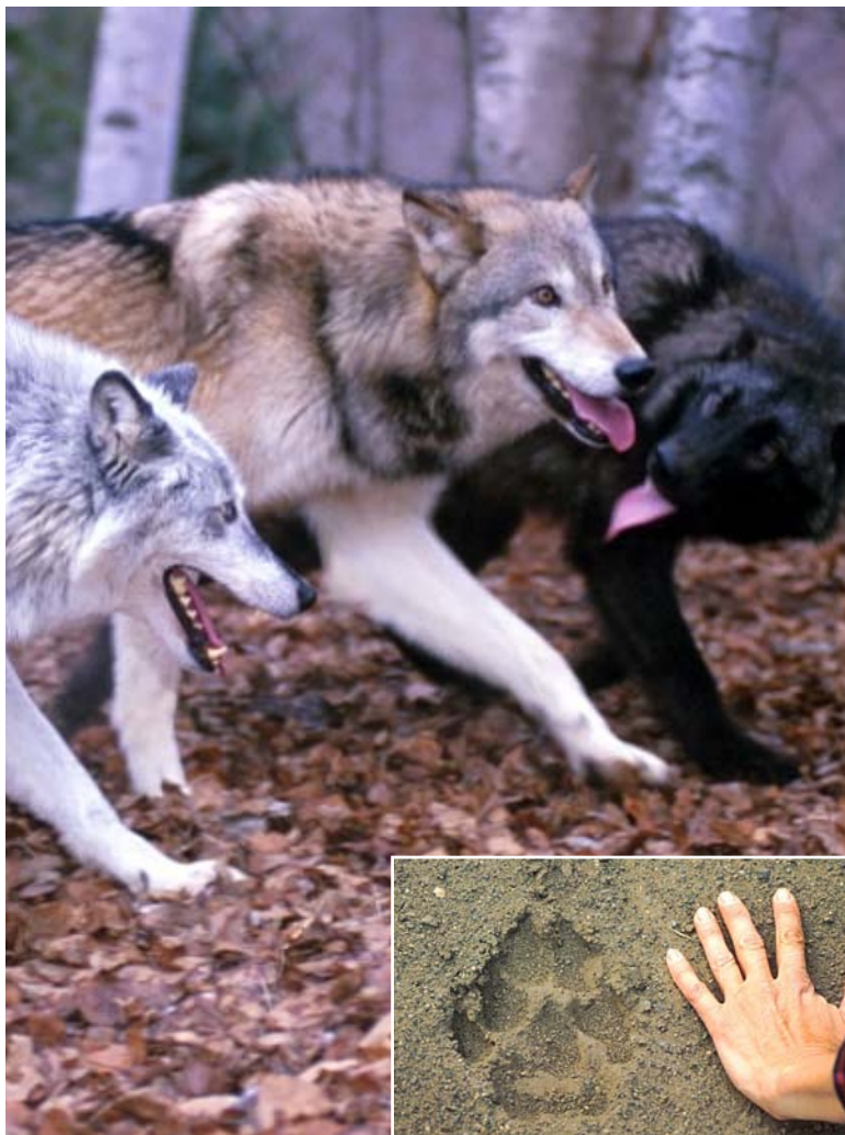
Note the black wolf in the back.