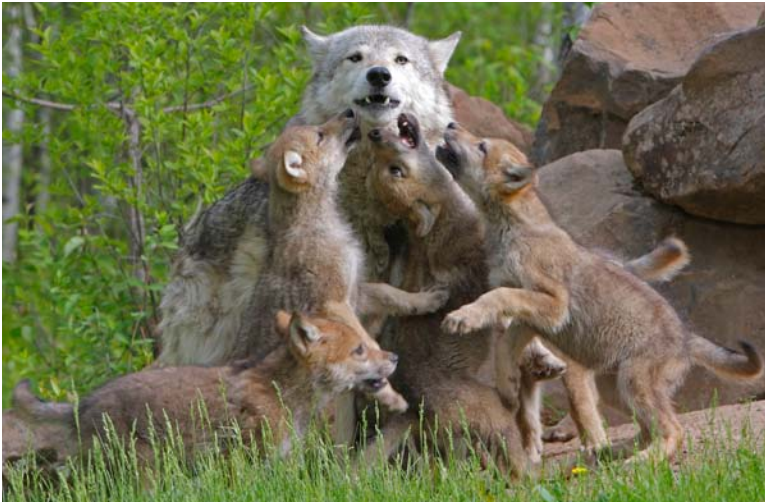
Wolf pups spend lots of time playing with other pack members.