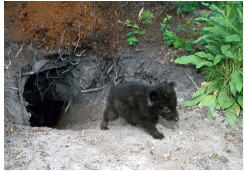
A wolf pup at the den entrance