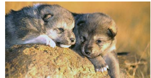
Gray wolf pups outside their den

In spring, the alpha female wolf digs a long tunnel with a den at the end. In the protection of the den, she gives birth to 4 to 6 pups. The pups are born blind and deaf, and they weigh only about as much as a can of soup.