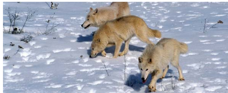
A wolf pack keeps track of animals that enter its territory.

Gray wolves aren't just gray. Their thick, warm fur can be tan to pure black. Wolves have wide feet to help them walk on top of snow.